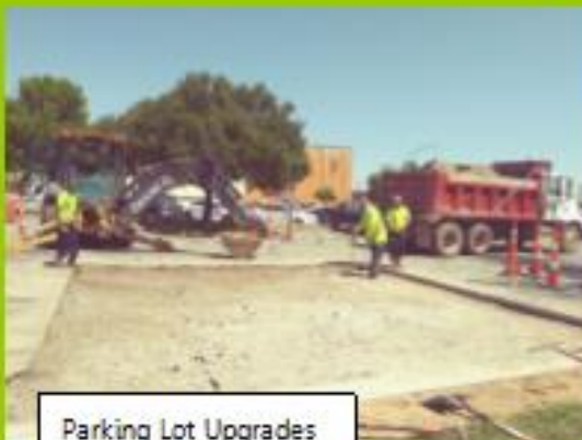
Parking Lot Upgrades