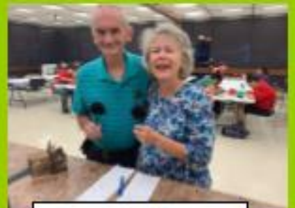
Adult Only Craft Nights

Become a library advocate by joining the Friends of the Lawton Public Library.