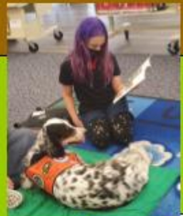
Sit, Stay, Read