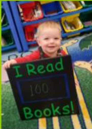
1,000 Books Before Kindergarten