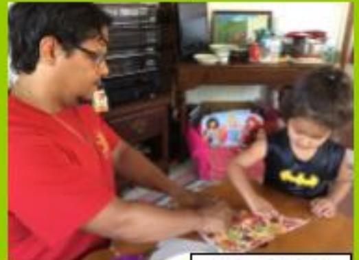
Grab & Go Crafts