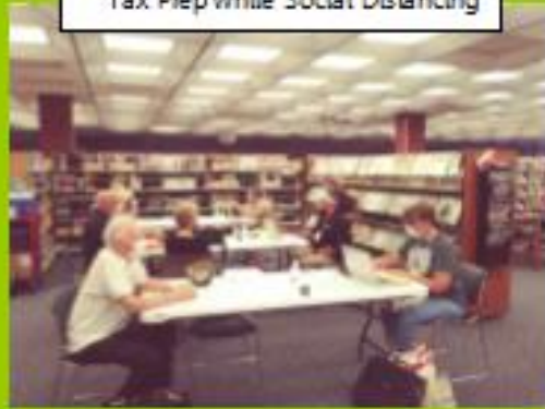
Tax Prep while Social Distancing