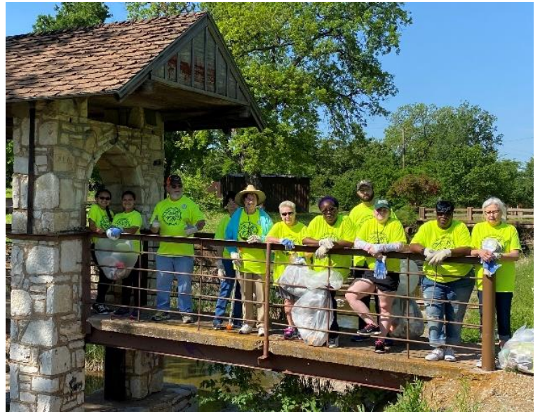
RSVP volunteers at Mattie Beal Park.

Thanks to everyone who participated in giving back to the Lawton community!