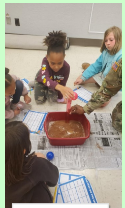
STEAM Camp: Alien Invasion