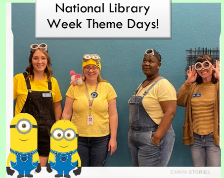
National Library Week Theme Days!