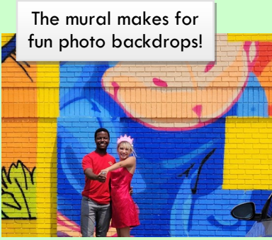
The mural makes for fun photo backdrops!