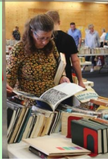
The annual book sale is always popular!