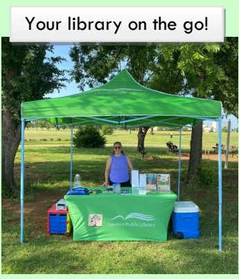
Your library on the go!