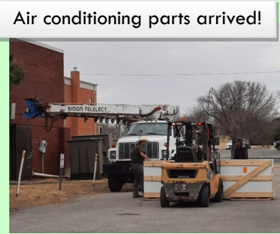
Air conditioning parts arrived!