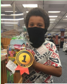
Contests throughout the year!