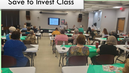
Save to Invest Class