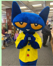
Pete the Cat stopped by for Take Your Child to the Library Day!