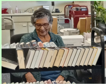
Our volunteers helped tag over 100,000 books!