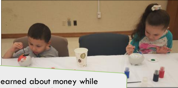
Kids learned about money while painting piggy banks.