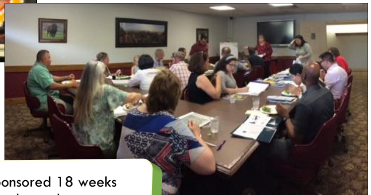
The Library co-sponsored 18 weeks of financial fitness classes last year.

Become a library advocate by joining the Friends of the Lawton Public Library.