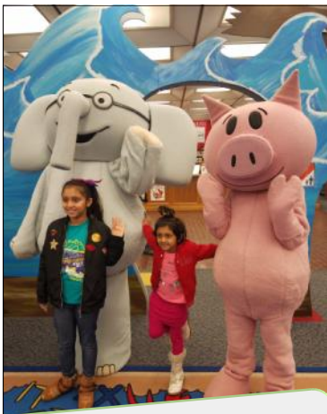
Elephant & Piggie visited the library.