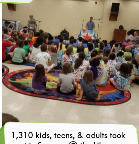
1,310 kids, teens, & adults took part in Summer @ the Library.