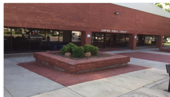
Lawton Public Library