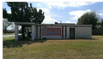
Kathleen Wyatt Nicholson Branch Library